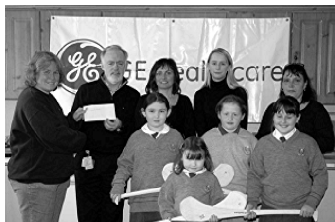
GE Healthcare Presentation