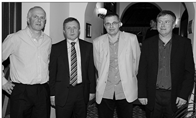
Selectors of the history making Carrigtwohill U-16 Football County Championship winning team.