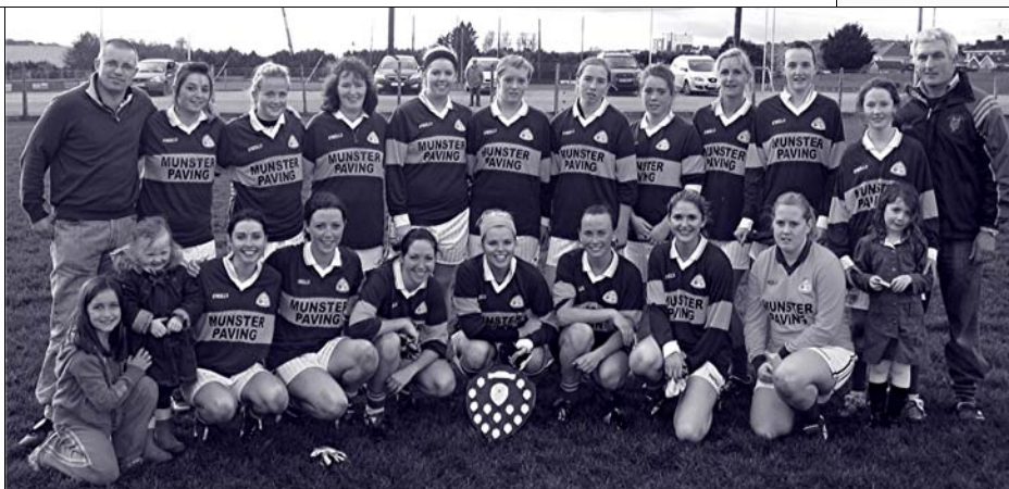
Carrigtwohill Junior Team - County League 12 a side Champions 2008

The Juniors began their campaign on Saturday the 14 th of March with a home game against Fermoy. The 12-a-side team also began their season on Sunday the 15 th of March against Mournabbey.