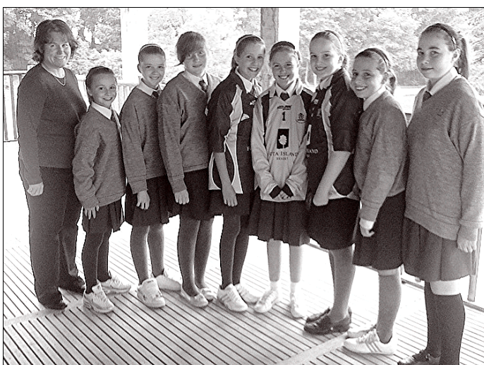
Fota Resort presentation of sponsorship for Sciath na Scol

We were also presented with a data projector and are in receipt of technical backup when needed.