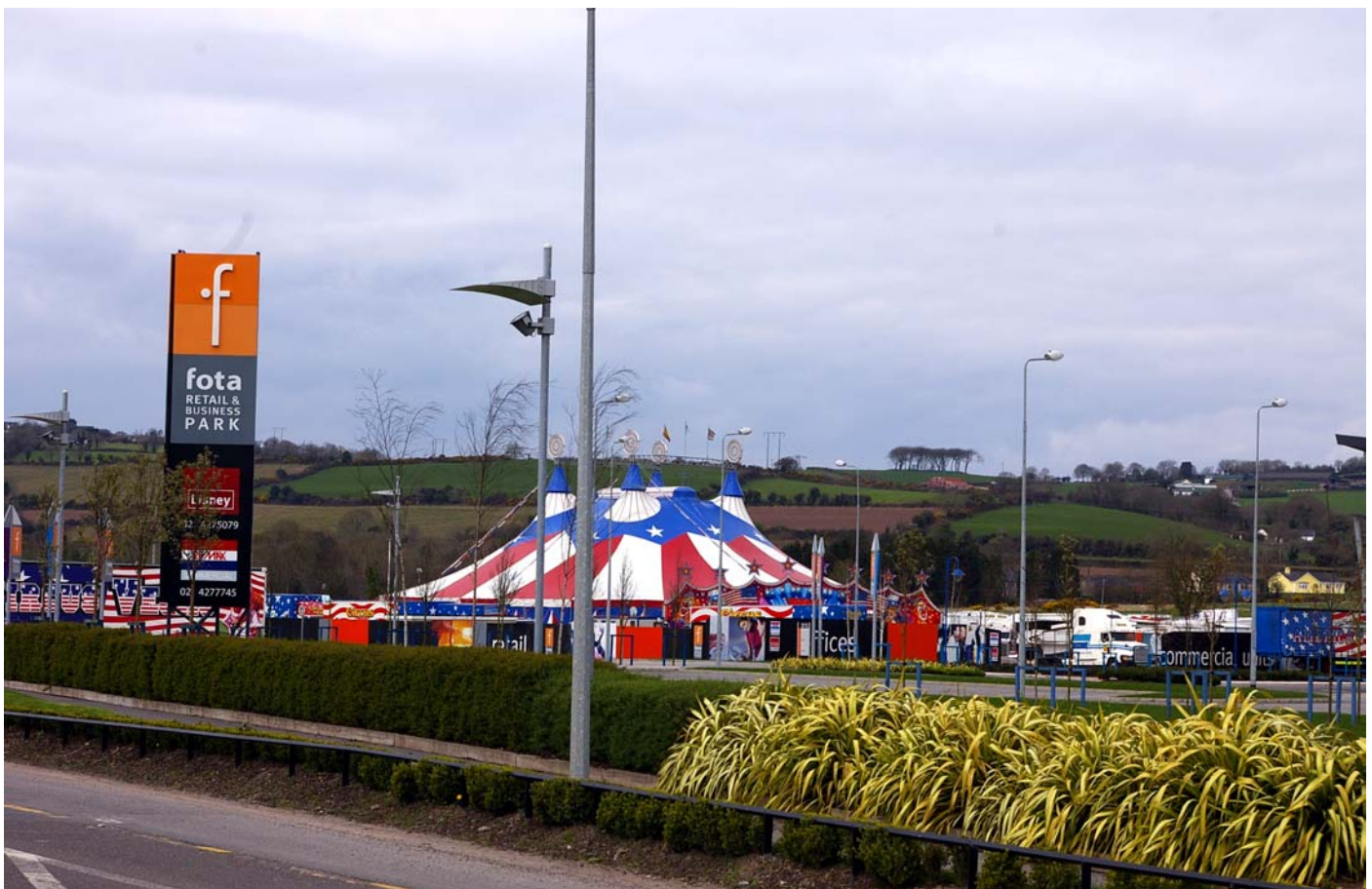
The Circus at Fota Retail & Business Park