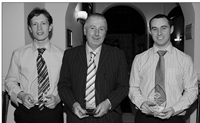
Selectors of the Carrigtwohill Minor A Football League Winning Team.